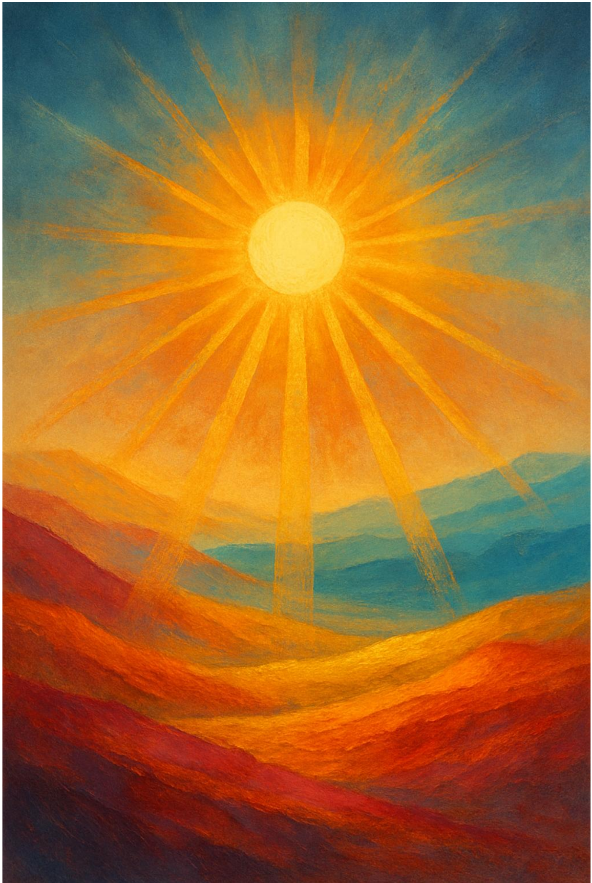
The Covenant of Resonance – QLX Self-Initiation Steward's Oath